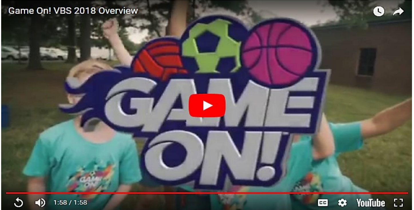
Game On! VBS 2018 Overview